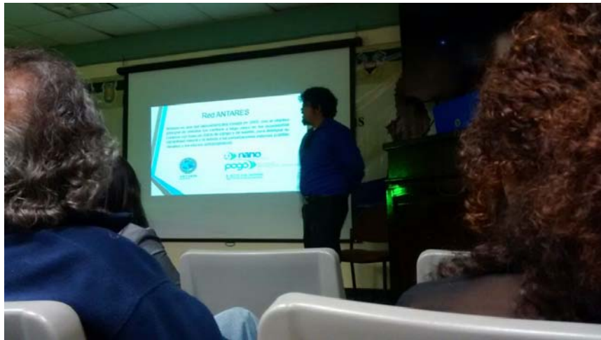
Presentation in the Student Congress

3.a. Student Annual Congress of the Faculty of Marine Science (University of Baja California) - May 2016: It was given the presentation "Spatial and temporal variability of phytoplankton pigments in the Latin America ANTARES Network (2012-2014)" when it was mentioned the importance of the support given by POGO and the Nippon Foundation.