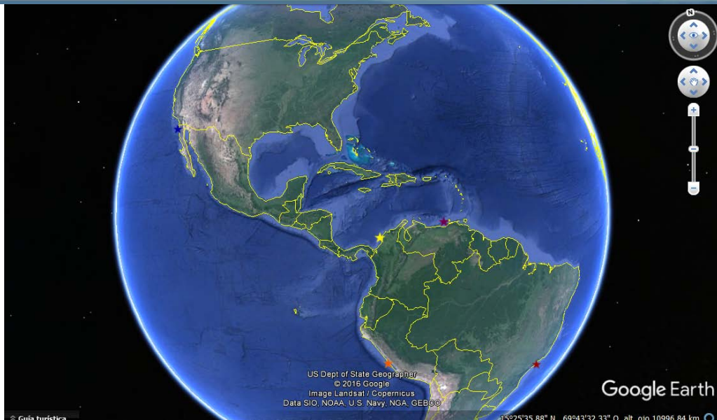
Visualization of the ANTARES stations in google earth.